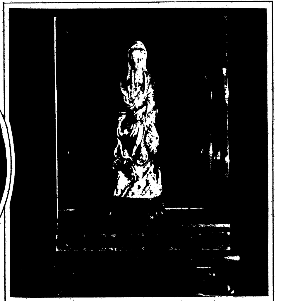
The largest art object of emerald green jade known, a 17-inch statuette of the goddess Kuan Yin, uniform in color except for a vein of lavender jadeite in the rocks at the base, from the collection of Edward I. Farmer, Inc.