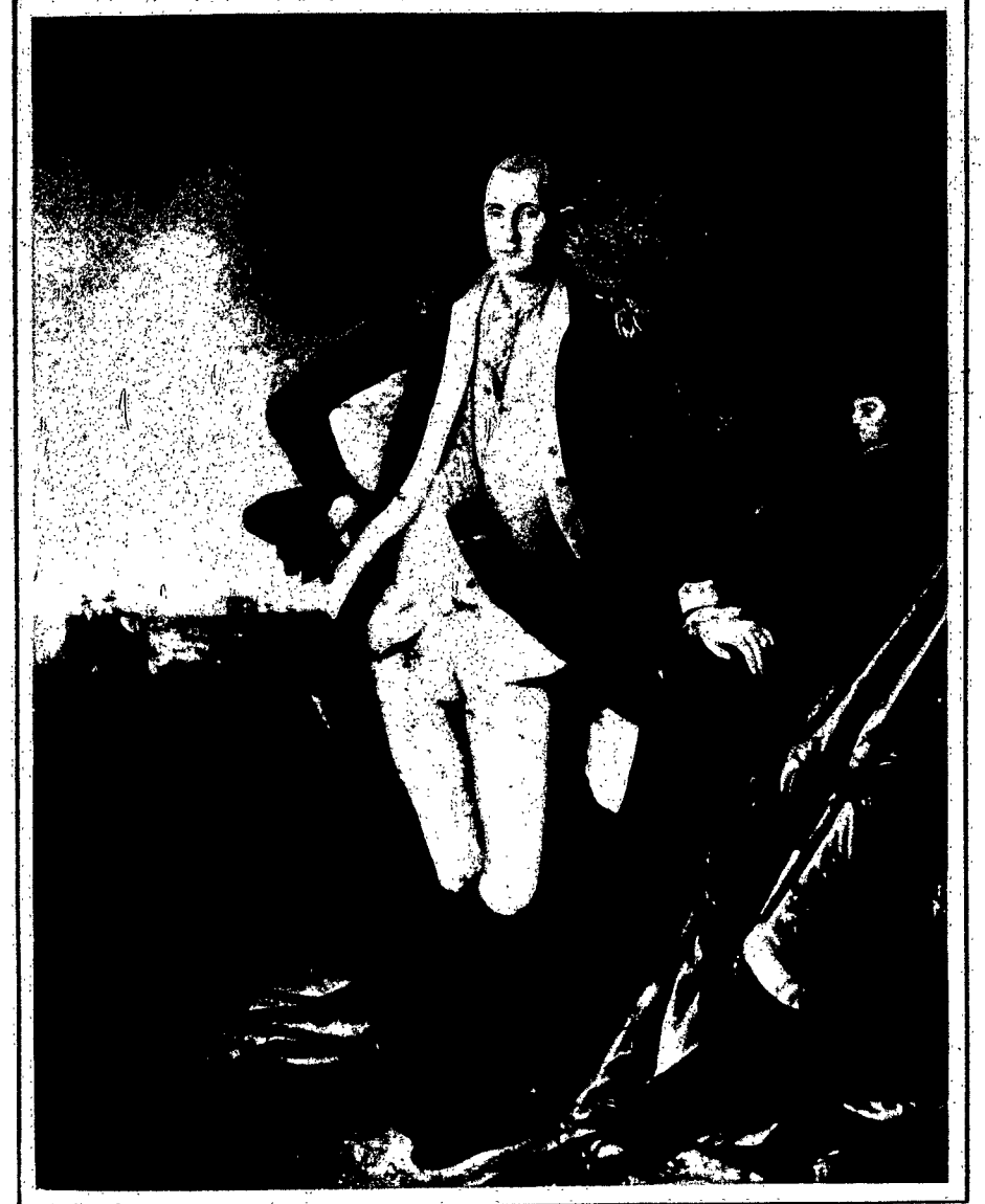
This familiar portrait of George Washington by Charles Willson Peale, recently brought back to this country from France, where it was taken by a companion of Rochambeau, has been shown at the Knoedler Galleries. Nassau Hall, Princeton University, is shown in the background.