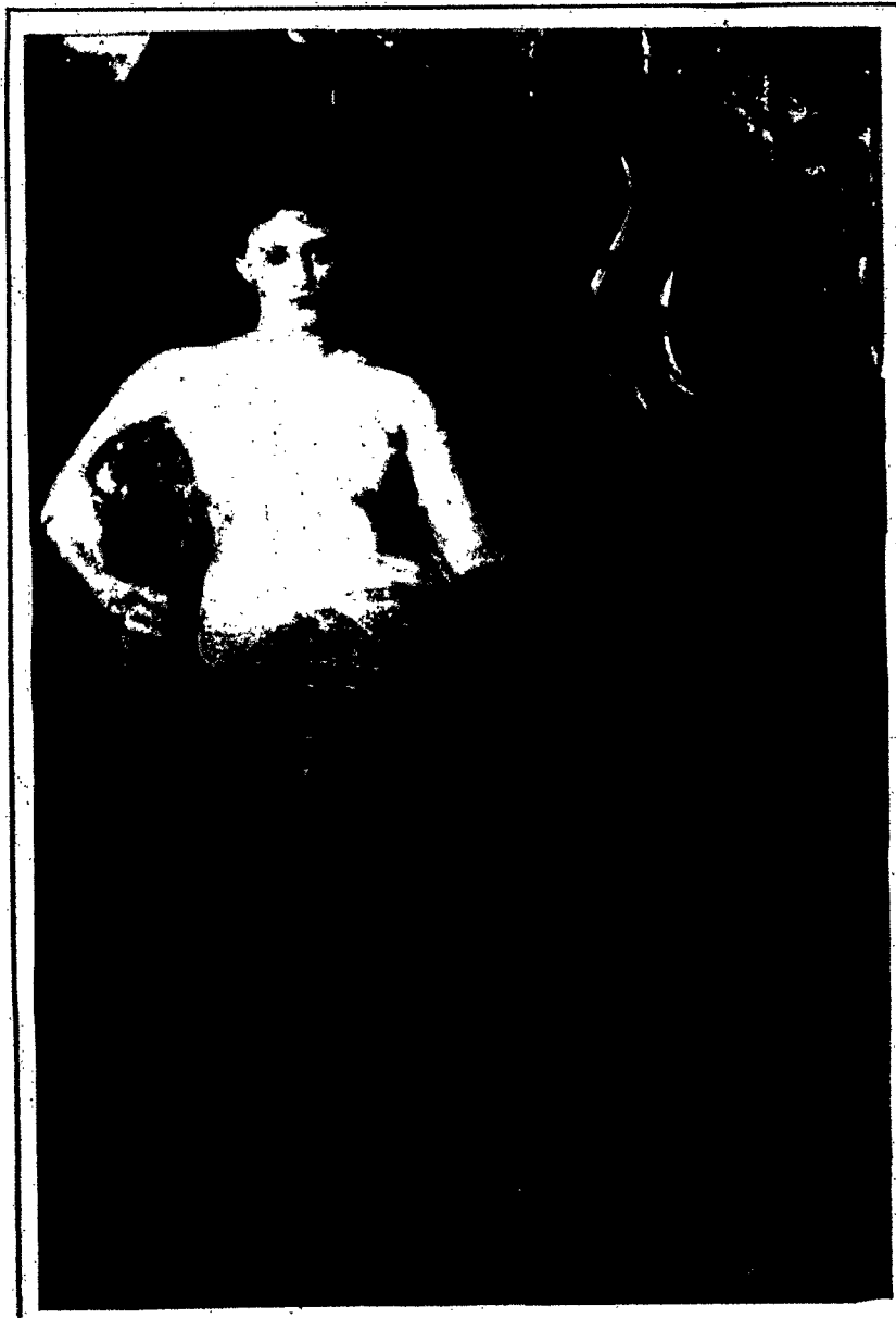
This half draped figure, above, by Abbott H. Thayer is exhibited at the Mûch Galleries.