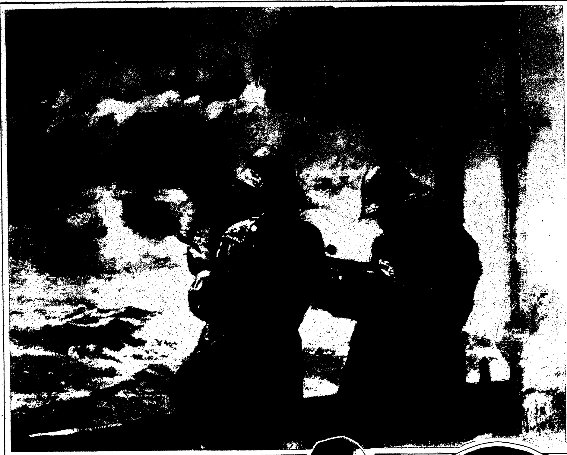
"Eight Bells," a notable example of Winslow Homer's marine paintings, recently sold for $50,000, shown at the John Levy Galleries.