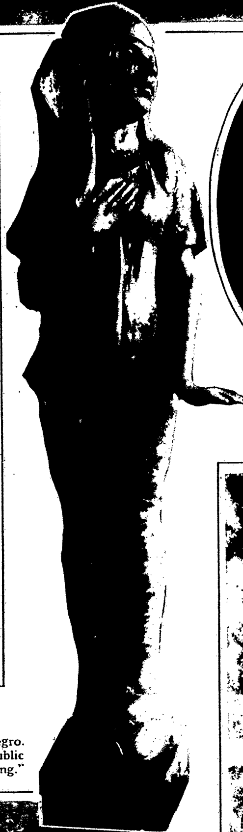
At right—"Ethiopia," by Meta Warrick Fuller, a negro pupil of Rodin; presented to the New York Public Library by the negro section of "America's Making."