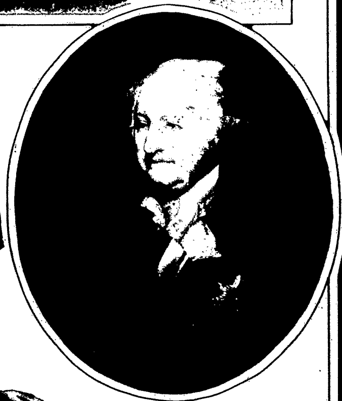
Portrait of the Marquis of Waterford by Gilbert Stuart, shown at the Galleries of Arthur Tooth & Sons.