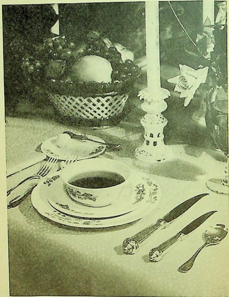
The social life of a household centers about its dining-table, and every accessory that builds the table-picture furthers the art of gracious living. This illustration shows one cover correctly set, in the dining-room of the Delineator Home Institute