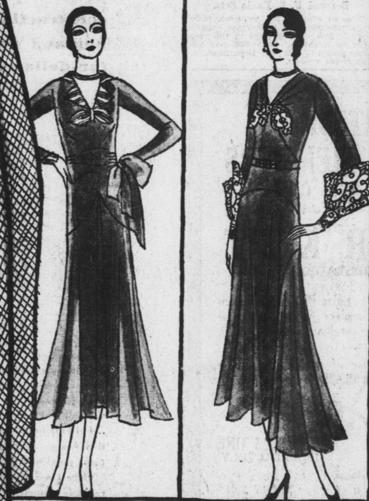
The 'Kerchief Dress' $15

But a very smart shade. Flat crepe, the circular flounces form a quaint, peplum in the back. Three ivory gardenias finish the neck.