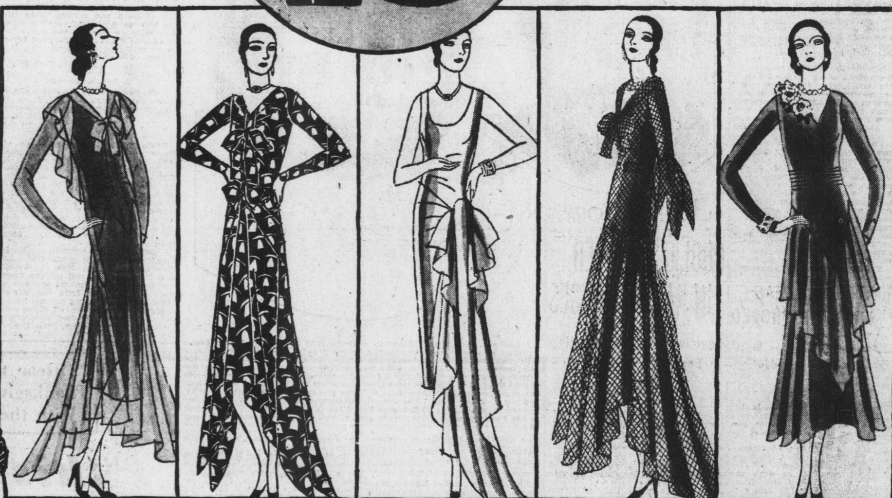
Patou Replica $15

In line and color, the latter being his dahlia. Chiffon, for informal wear; the skirt especially graceful with applied godets.