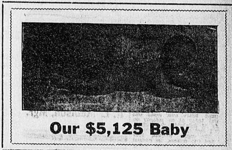
Our $5,125 Baby