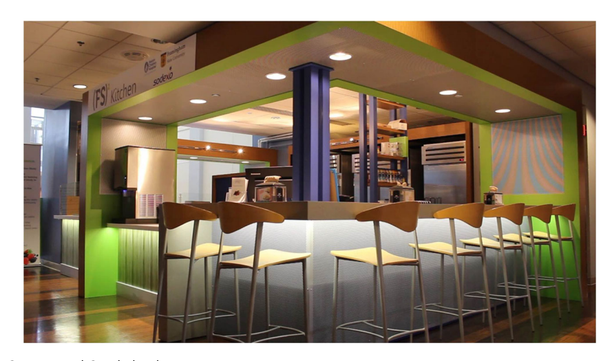
FIGURE 2 Framingham State Food Study kitchen.

items. Additional SAS programming allowed for automatic substitution of menu items in production sheets, according to the master list, with items that maintained the macronutrient composition of the meal. The food service team reviewed each production sheet before food preparation and flagged any meal that contained a substitute menu item. The flag was an additional alert for food service staff to be extra vigilant. This system maximized participant safety, without compromising differentiation between diets.